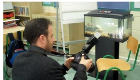
St Clare's Aquarium in focus

We have our fish tank now for just over two weeks. We were given two dogfish, two goldsinny wrasse fish and six anemones. Just today we noticed two new sea anemones in the tank. They are tiny. Sea anemones reproduce by budding off baby sea anemones. The babies stay connected to the adult until it is old enough to go out on their own. If a sea anemone is torn apart by rocks, then each part becomes a new sea anemone. We are very excited about our new additions to the tank and we will name them shortly. One of our goldsinny wrasse seems to really like the filter